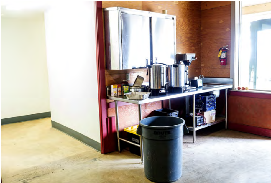
Indoor facilities: Kitchen, Bathrooms