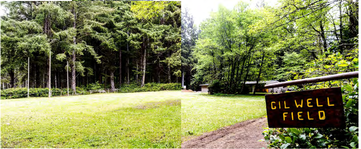
Big Troop Assembly area with 3 flag poles