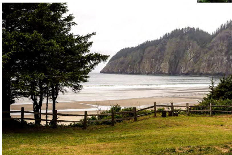
Camp step down to Pacific Ocean