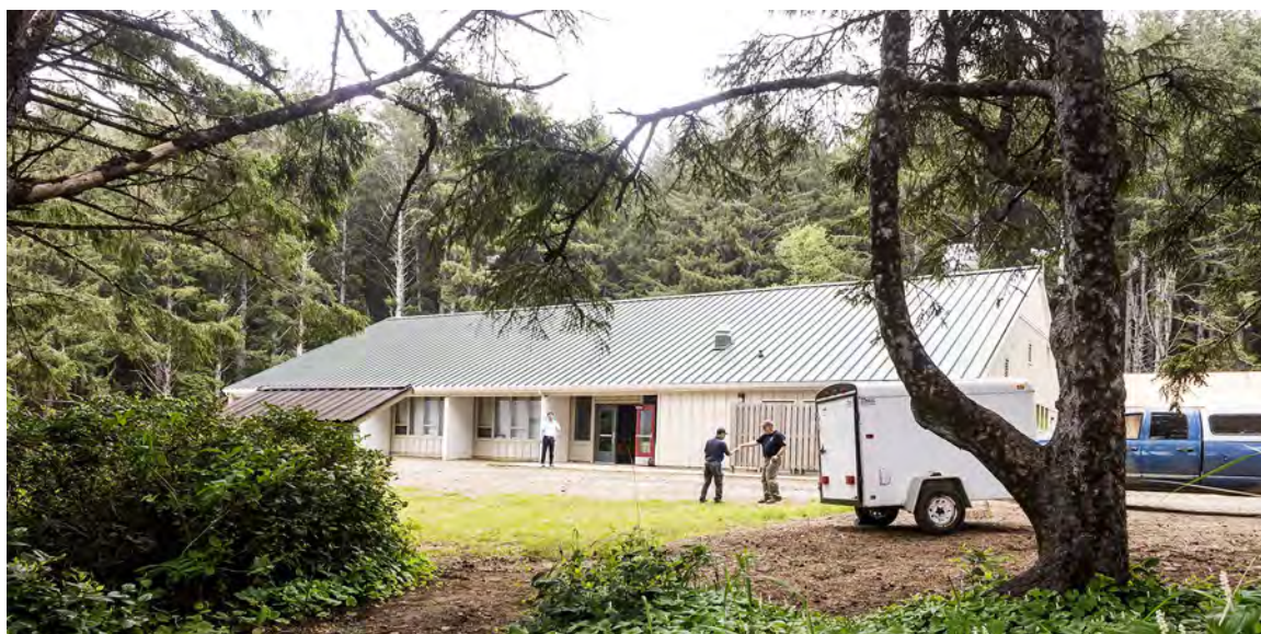
Back view of Conference room—Troop Meeting area