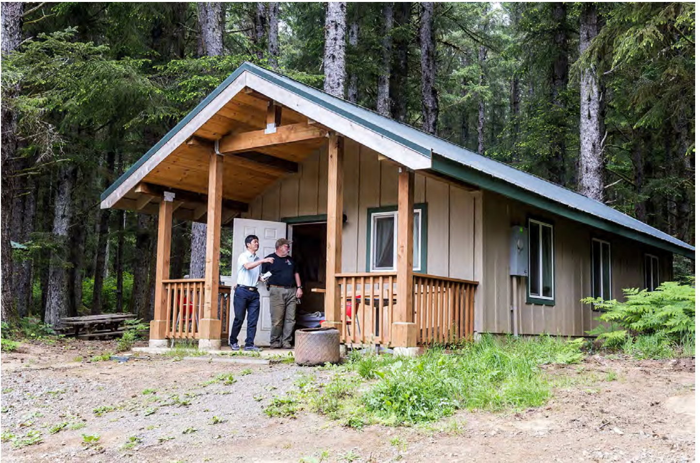
Staff cabins can accommodate 4 to 5 members