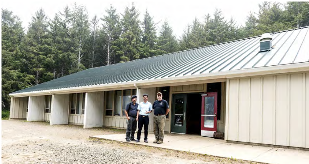
Front view of Conference room—Troop Meeting area