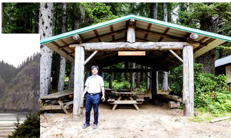
Patrol activity sites