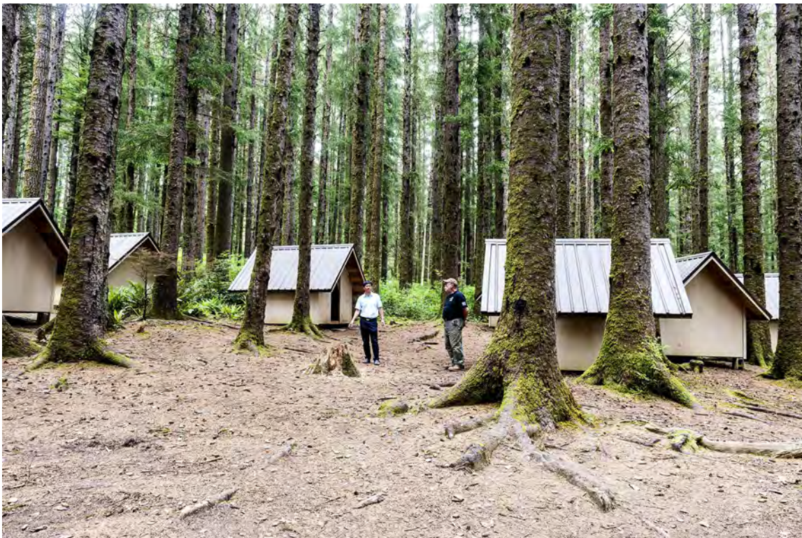
Typical one patrol campsite area